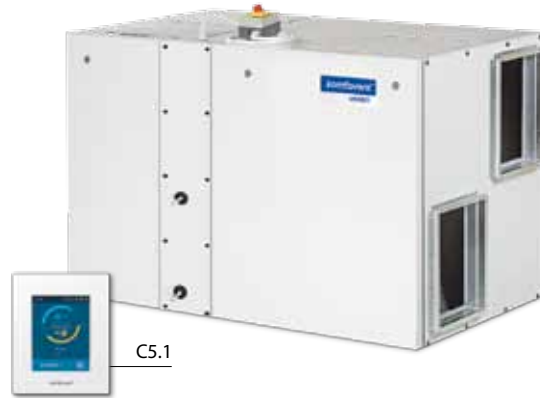
The photo is intended for informational purposes only, exact details may vary.